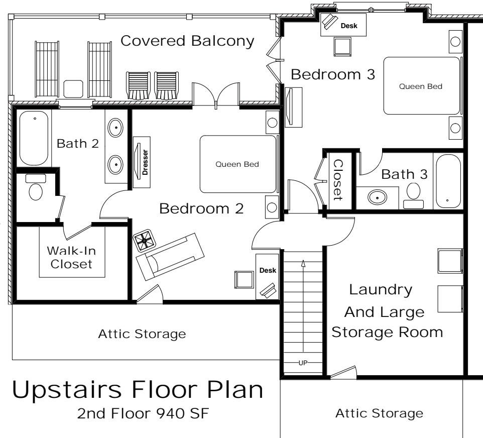
Upstairs Floor Plan 2nd Floor 940 SF

NOTE: Room Sizes May Not Be Exact As Sizes Vary From House To House As Each Was Built On Site And The Human Element Is Involved.